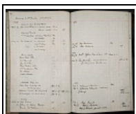
Job book: 53063 Page: 20