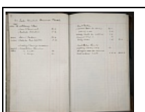
Job book: 53063 Page: 19

The following information about M294 has been extracted from the job books: