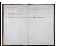
Job book: 53062 Page: 7