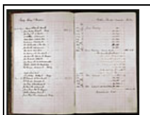
Job book: 53062 Page: 4

The following information about M210 has been extracted from the job books: