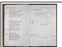
Job book: 53062 Page: 5