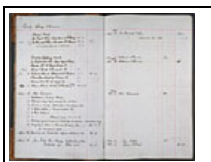
Job book: 53062 Page: 6