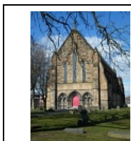
Exterior of Govan Parish Church