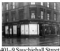
401-9 Sauchiehall Street, 1929