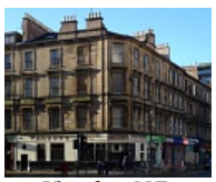
View from N.E.