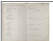
Job book: 53061 Page: 13

The following information about M107 has been extracted from the job books: