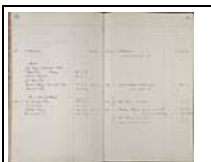
Job book: 53061 Page: 15