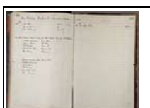
Job book: 53061 Page: 241