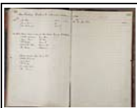
Job book: 53061 Page: 241