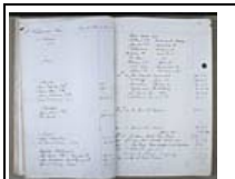
Job book: 53059 Page: 139