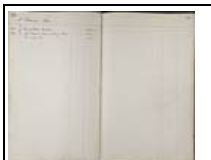
Job book: 53061 Page: 69