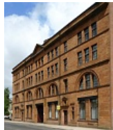
Front from S.E.