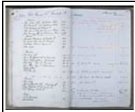
Job book: 53059 Page: 145