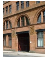
Entrance to yard