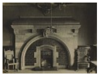
Fireplace, auction hall, Skin and Hide Market, 1903