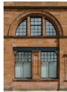
Ground- and first-floor windows